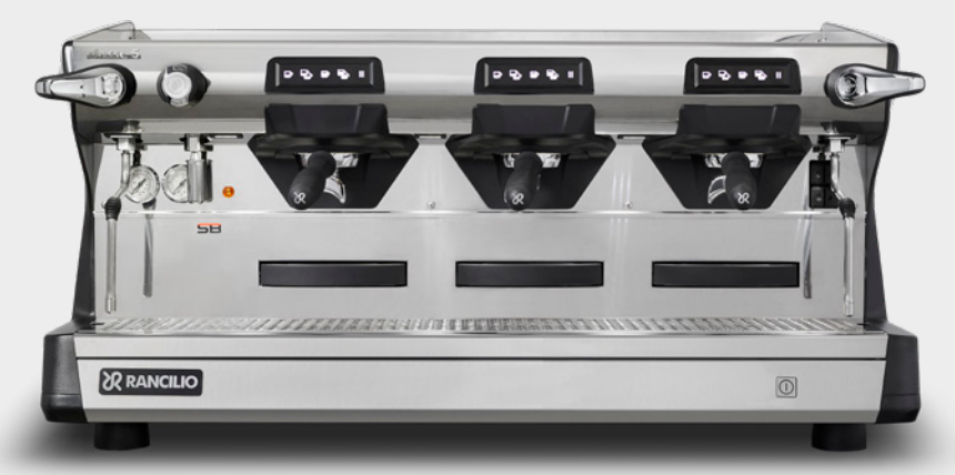
C5 USB 3GR TALL